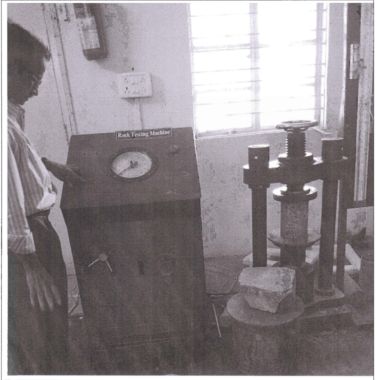
Figure 1: Compressive strength testing of the stabilized soil core specimen