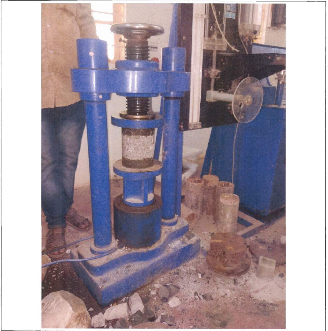
Figure 1: Compressive strength testing of the stabilized core specimen